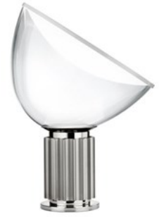
F6604004 Anodized Silver

Using a minimalist approach, Achille and Pier Giacomo Castiglioni used perspective to change the way we see everyday objects.