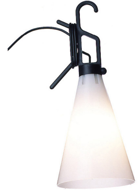
● FU378030 Black