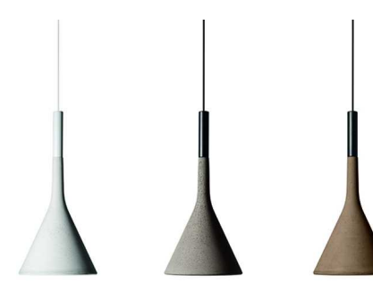
Brightness light semi-diffused and direct down light