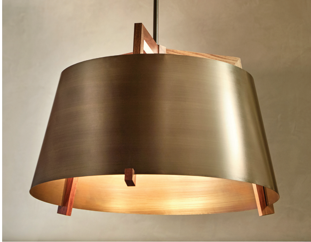
distressed brass, walnut, rigid suspension, Ignis 24 above and below