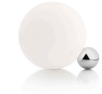
F1952050 Polished Aluminum