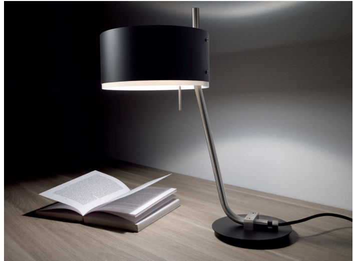
Table lamp with internal iron structure, finished in satin nickel. The shade is black finished aluminum, with a white, B1 flame resistant PVC interior lining and exposed steel screws. Upper black aluminum diffuser is included with fixture. Lamp rests on iron swivel disk, allowing for 360% rotation, and electrical cord features a lamp holder switch, or a pull-string switch. Additional metal lamp shades may be ordered separately as needed. Only the fixture finishing and lamp shade color are customizable.