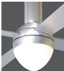
brushed aluminum with 650/651 light