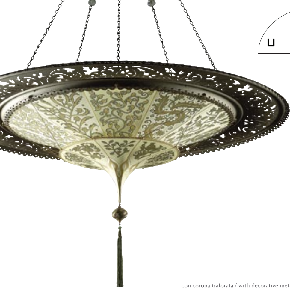
con corona traforata / with decorative metal ring