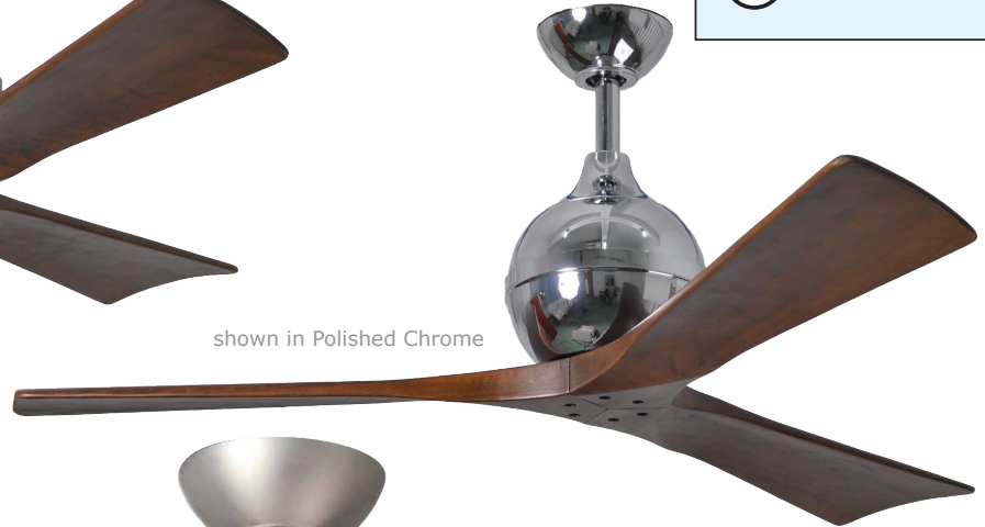
shown in Polished Chrome