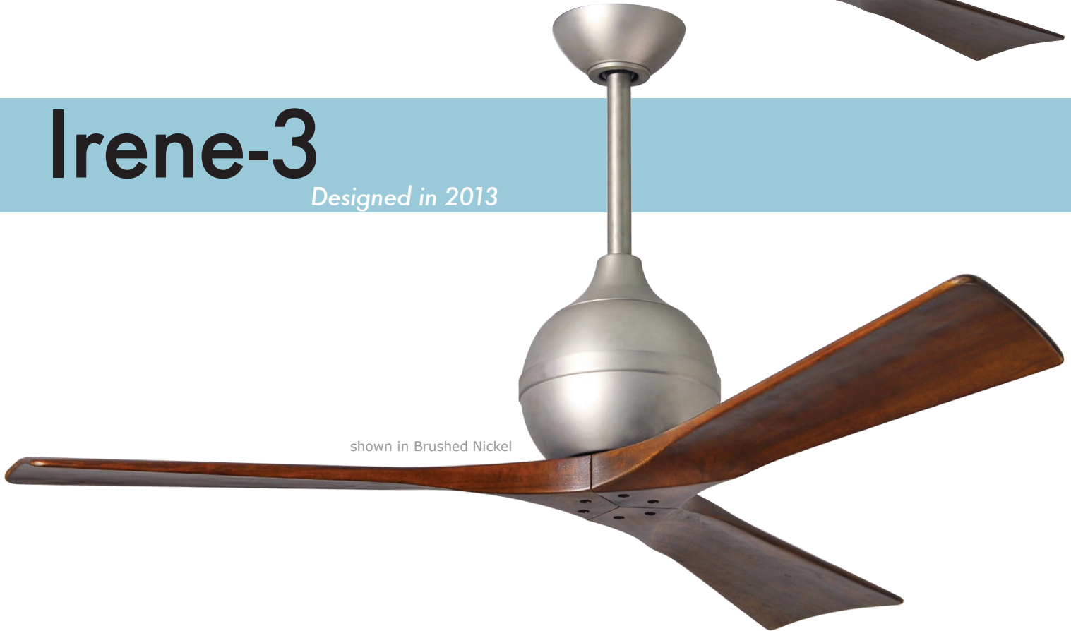
shown in Brushed Nickel