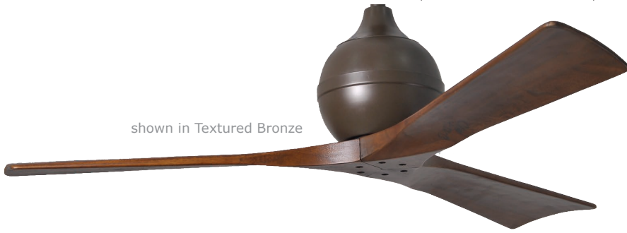
shown in Textured Bronze