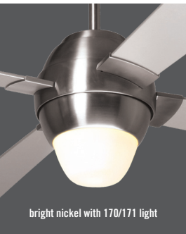
bright nickel with 170/171 light