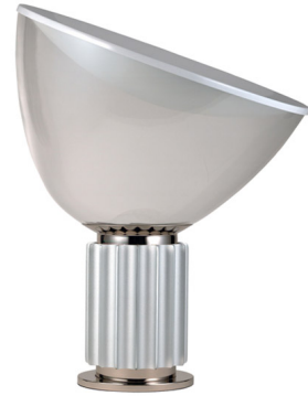
FU660004 Anodized Aluminum