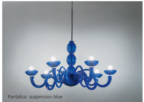
Pantalica suspension blue