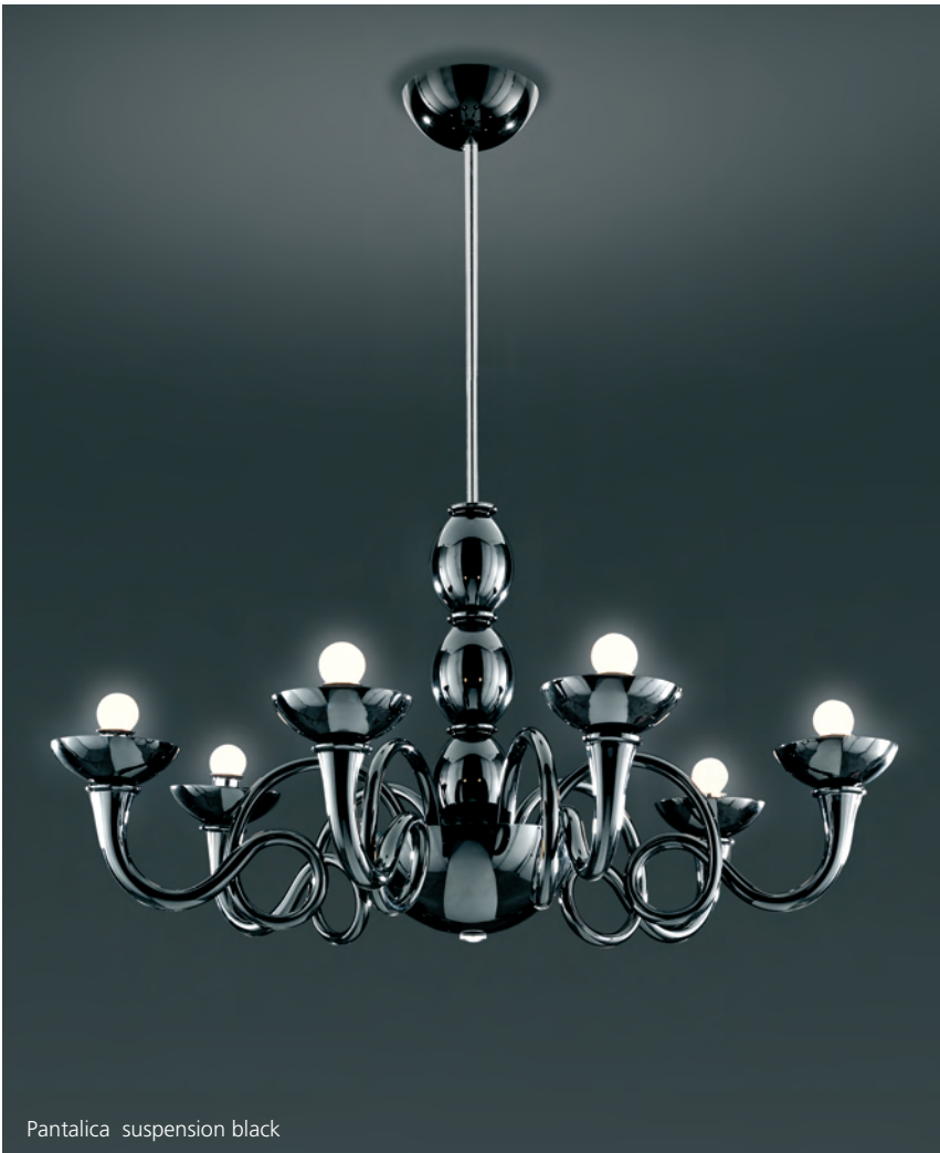
Pantalica suspension black