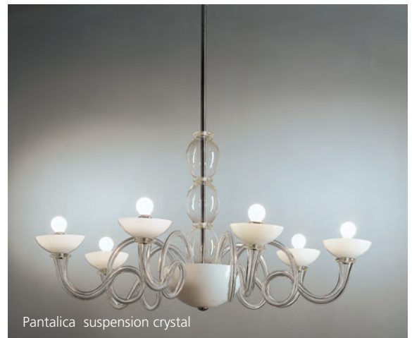
Pantalica suspension crystal