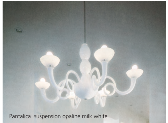
Pantalica suspension opaline milk white