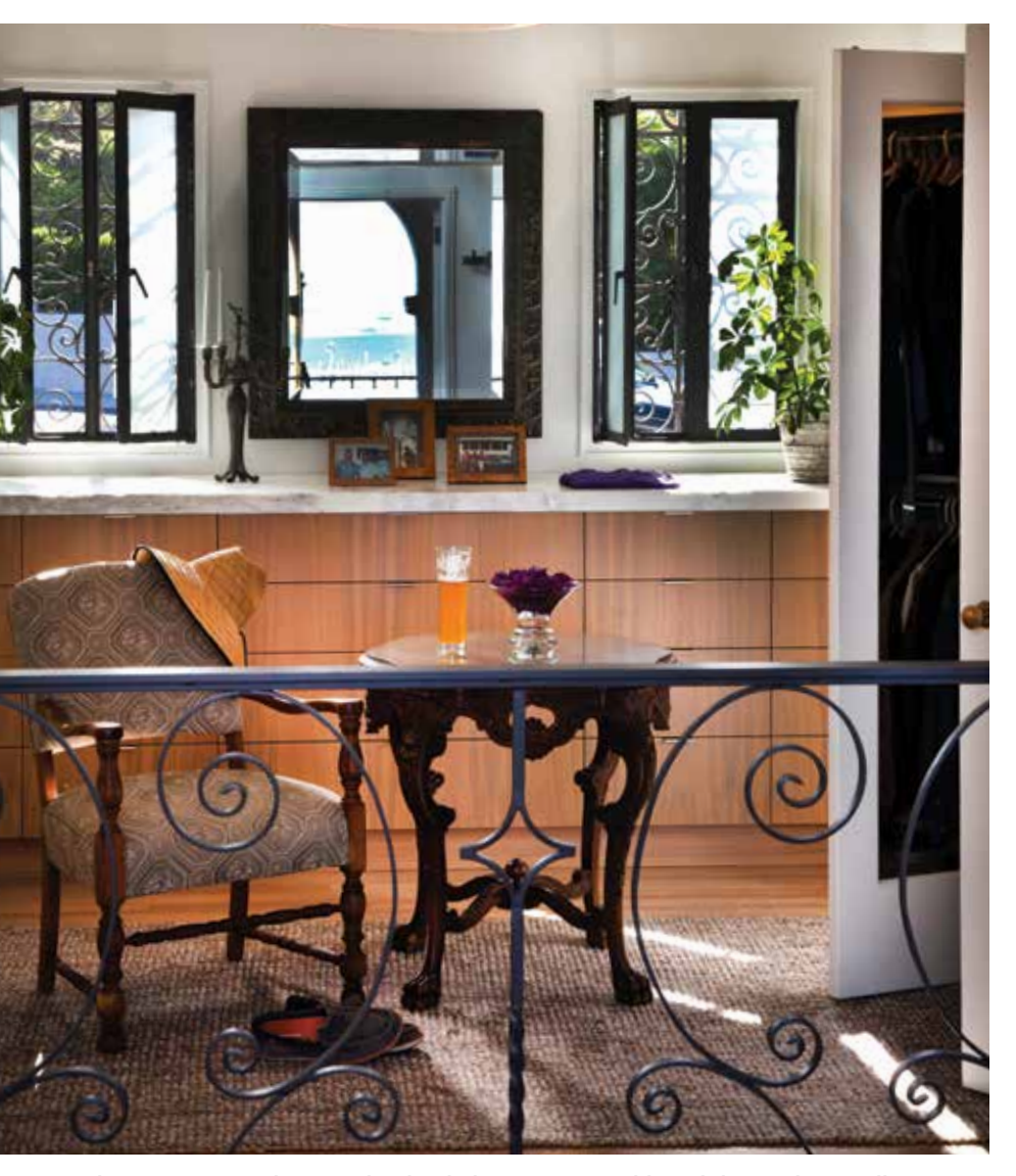
The master dressing room on the upper level includes an antique table and chair and two walk-in closets. The new ironwork reproduces the design of the original railing on the staircase.

The exterior railings, window grilles and iron gates in teal, as well as the front door and interior railings in chocolate brown, were stripped to their original finish. Steel case windows and hardware were preserved. The multicolored, coffered ceiling above the entry's dual staircase is now an unpretentious white.