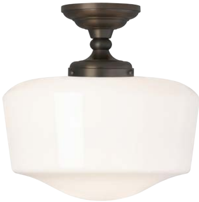
WHITE Shown approximately 35% actual size.