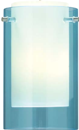
AQUAMARINE Shown approximately 35% actual size.