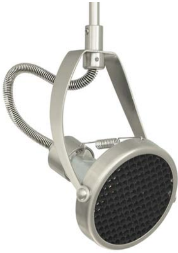
SPORTSTER WITH EGGRATE LOUVER Shown approximately 50% actual size.