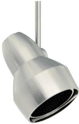
MINI OM WITH SOLID METAL ACCESSORY AND EGGCRATE LOUVER