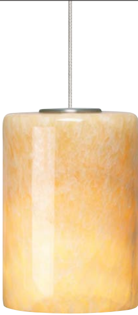
Shown approximately 25% actual size.