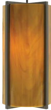
BEACH AMBER Shown approximately 25% actual size.