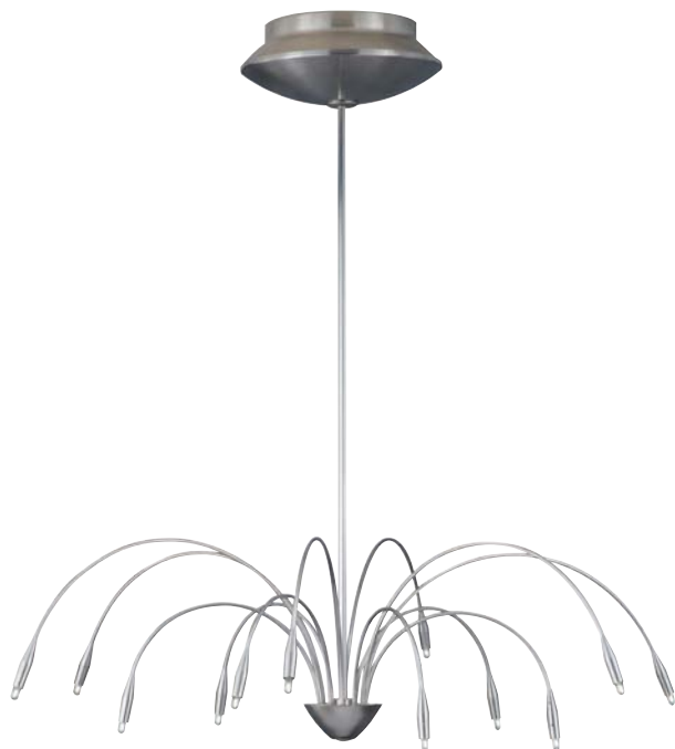
Shown approximately 15% actual size.